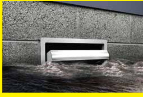
FOUNDATION FLOOD VENTS